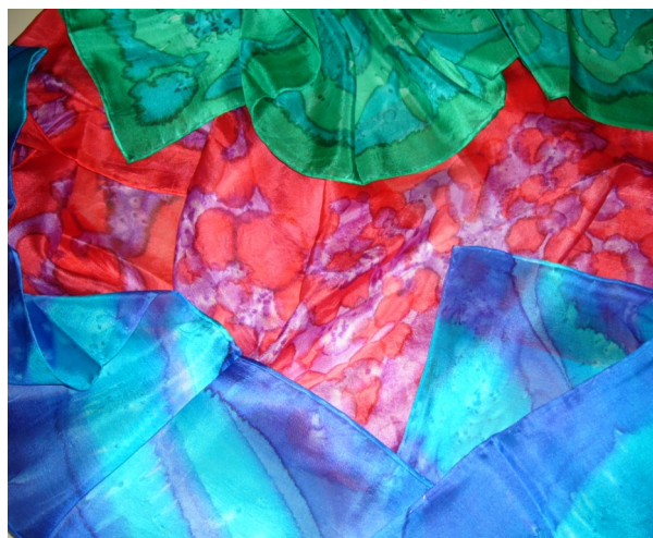
Judy has beautiful hand-painted silk scarves For $25 or $30