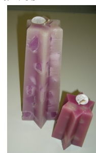
Judy makes candles in many colours in these shapes priced at $5 and $10.