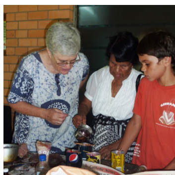
Here she is showing a mother and son how to make candles