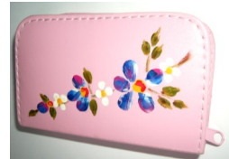
Manicure set $6

There is a wide variety of gifts in the Shop.