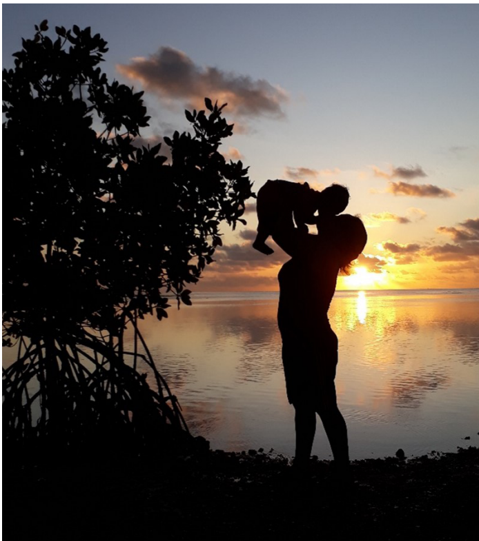
Mother & Child in Kiribati