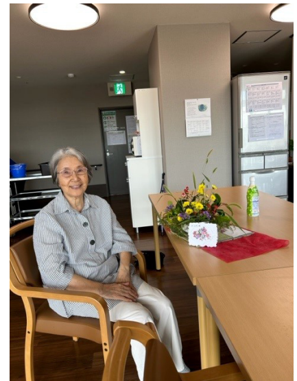
Sisters viewing resources and the 'Bookmark' resource (front & back).