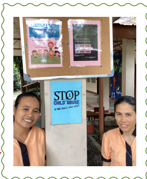
Right: Posters on display.